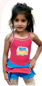
RSD Leotard (RSD & RSB)