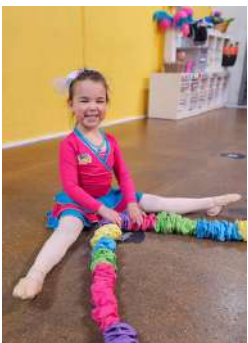
Teach your child to see details & follow direction