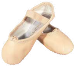
Pink Ballet Shoes (Girls' READY SET BALLET)