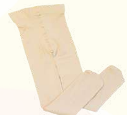
Pink Tights - Footed/Convertible (READY SET BALLET)