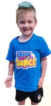
RSD Shorts (RSD & RSB)