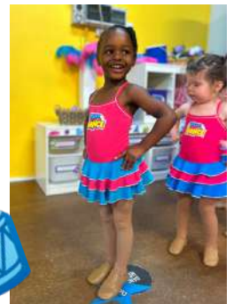
Improve your child's listening