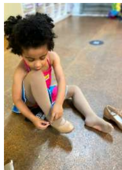
Advance your child's motor skills & co-ordination