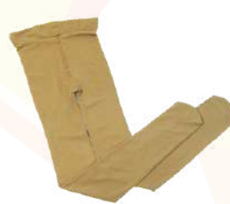
Tan Tights - Footed/Convertible (RSD & Tiny Tumblers)