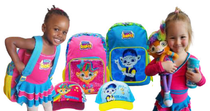
TWIRL & FREEZE and other RSD Merchandise

*More DSV and READY SET DANCE branded items available at reception or via our online store >>> https://dancestreamvictoria.com.au/store/