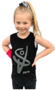
DSV Activewear Various items available (TINY TUMBLERS)