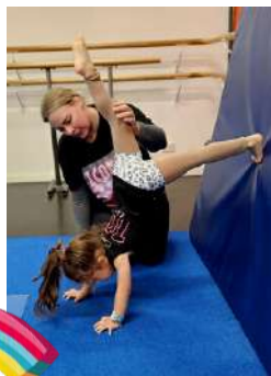
Improve your child's strength & flexibility