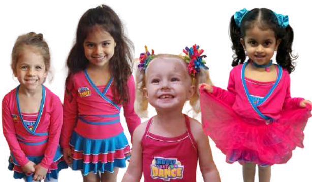
Crossover | Hair Accessories | Tulle Tutu (RSD & RSB) (RSD & RSB) (RSB Only)