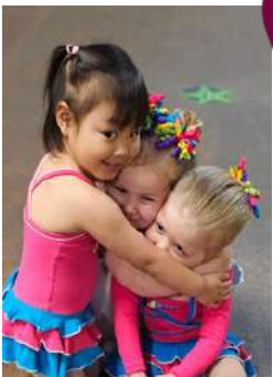
Help your child to make friends