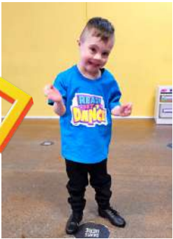
Improve your child's memory

At DANCE STREAM VICTORIA, we believe that dance is the perfect activity to help your preschooler develop the motor, cognitive, and social skills that they need in preparation for big school! There is nothing more rewarding for our parents than watching their little ones meet important milestones in their dance classes that can then be transferred into everyday life!