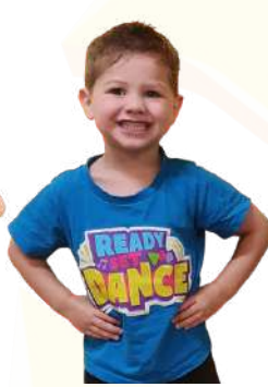
RSD Tshirt (RSD & RSB)