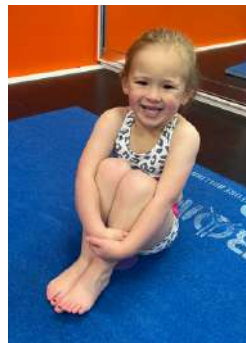
Increase your child's attention span