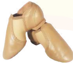
Tan Jazz Shoes (Girls' READY SET DANCE)