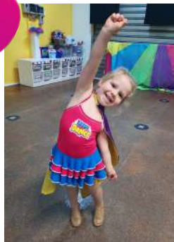
Boost your child's confidence