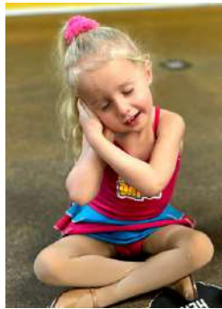
Feed your child's imagination