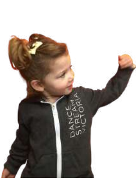
DSV Hoodie (Included on first invoice - come in to the studio for a fitting!)