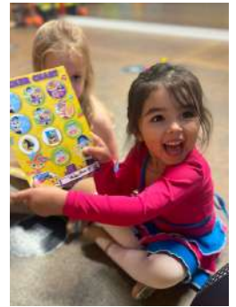
Help your child to express their emotions